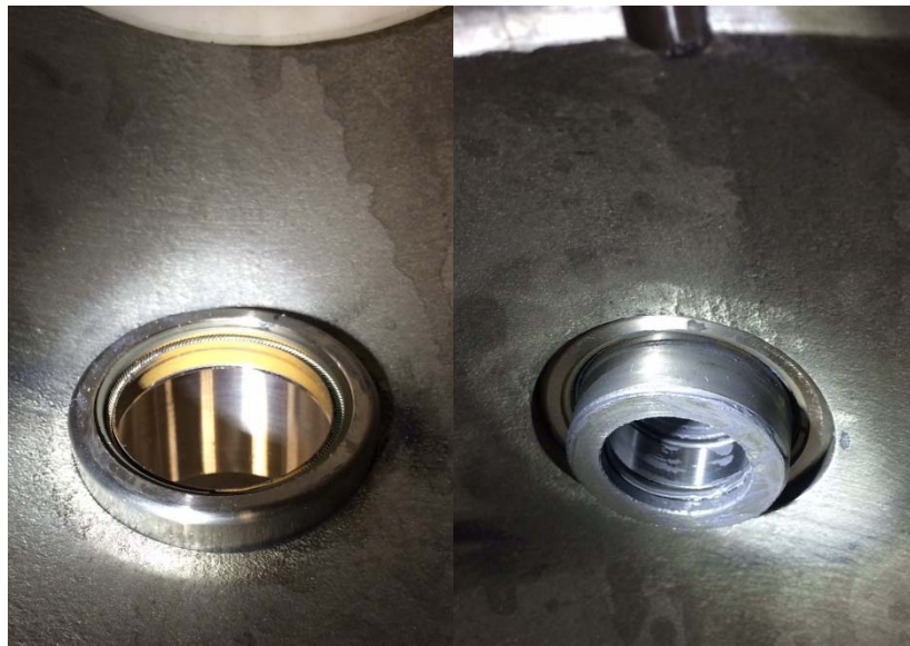
Figure 2. Shafts and Regulator Removed

If one or both bushings have moved, they will appear as shown in Figure 1 above. In Figure 2 below, shafts and regulator were removed for clarity.